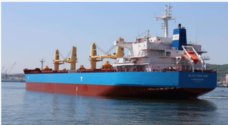
MV ALKYONI SB – Maiden Voyage 16 May 2014

A Team is not a group of people who work together. A Team is a group of people who trust each other. This is AEN's Team!